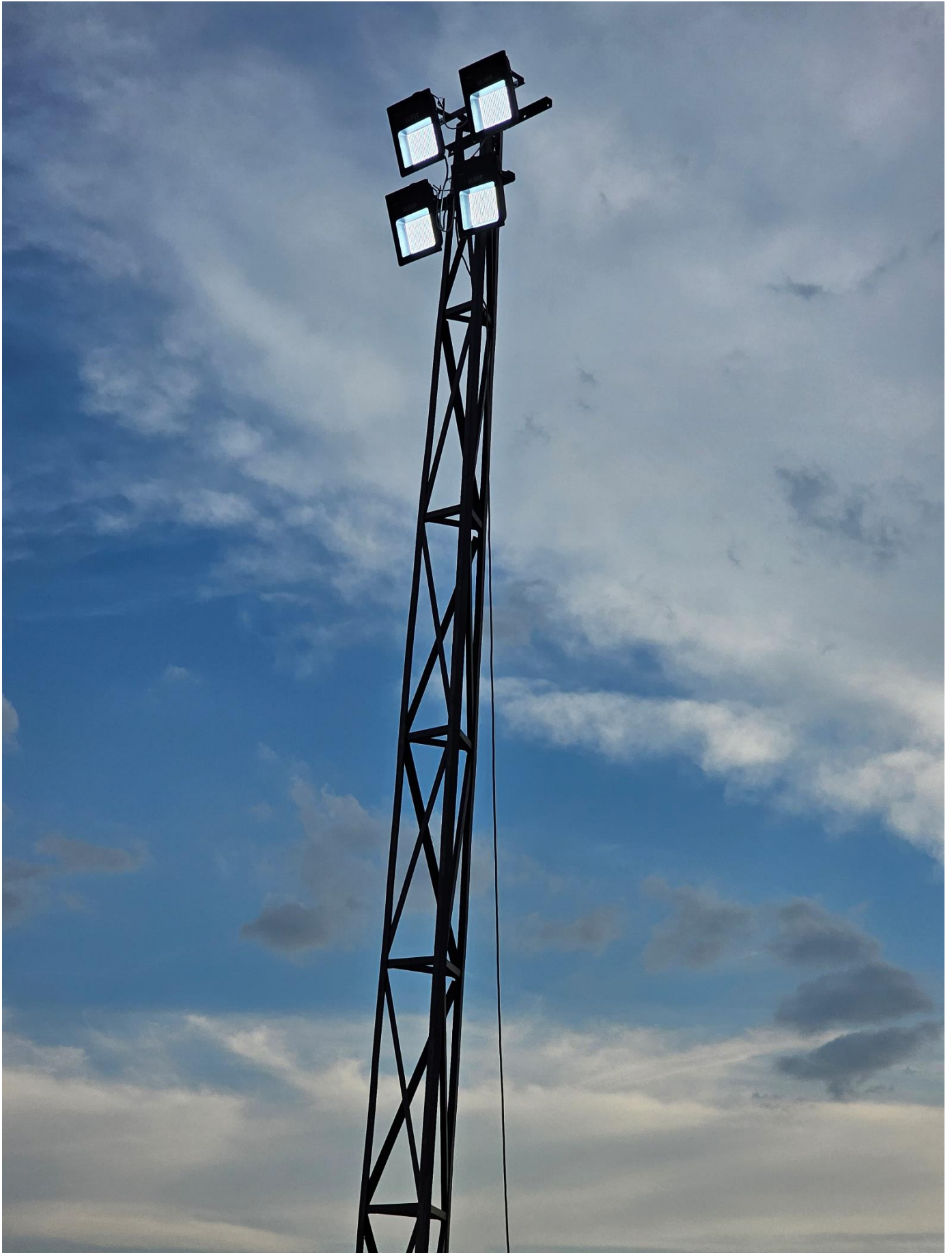
An image showing one of the floodlight towers in the fields at MAKSETH